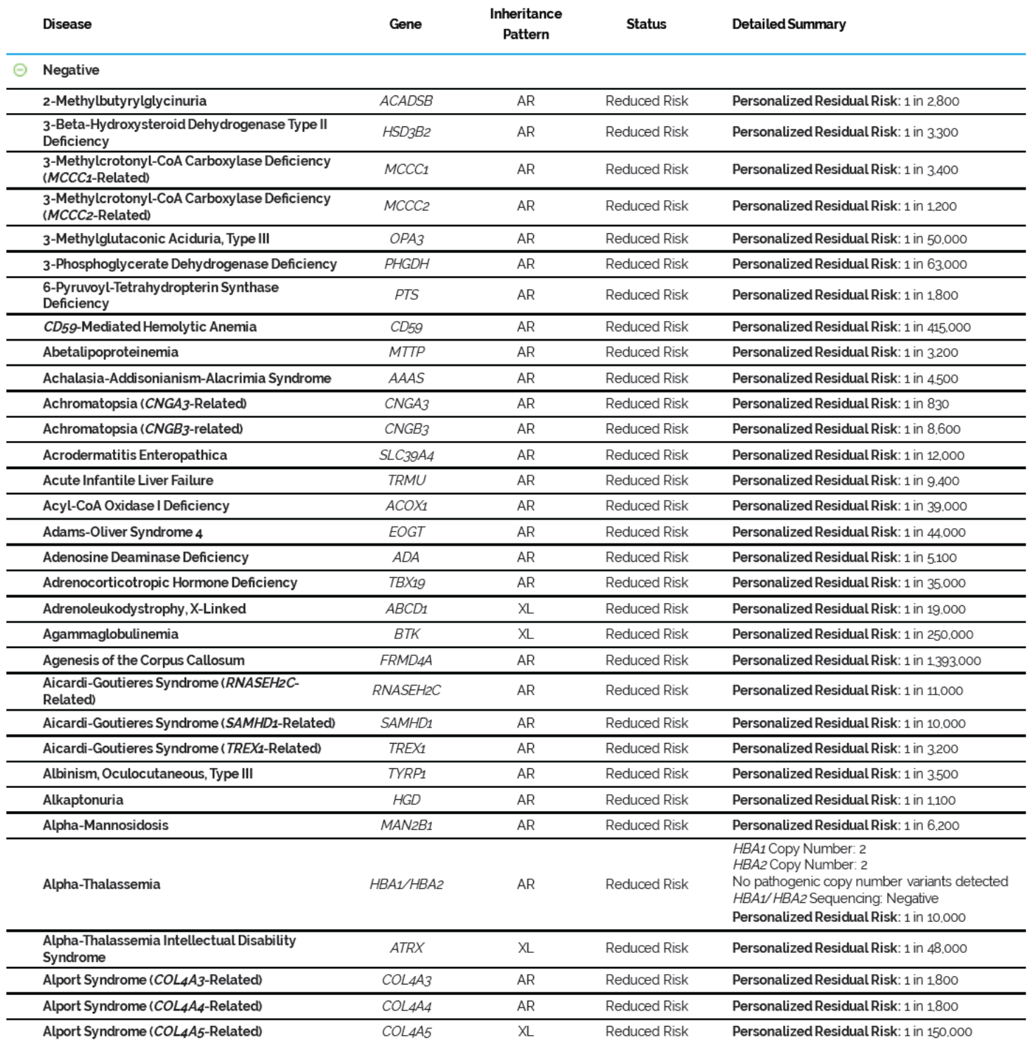
Table 1: List of genes and diseases tested with detailed results

The personalized residual risks listed below are specific to this individual. The complete residual risk table is available at go.sema4.com/residualrisk